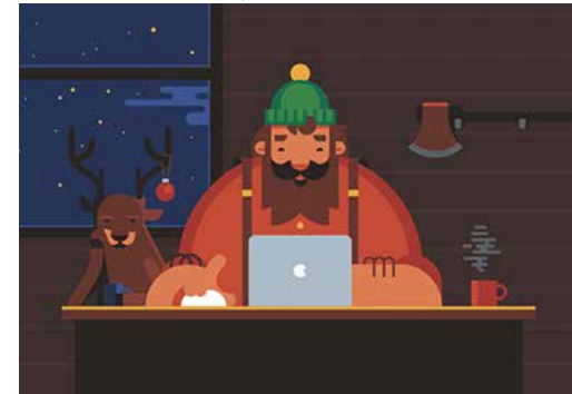
2D Explainer Videos